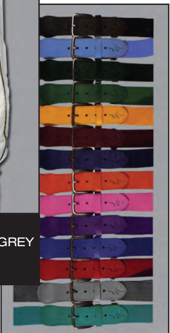
BELTS* COLOR: SEE TEAM REP SIZES: ONE SIZE