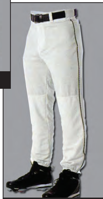
PANT* COLOR: WHITE OR GREY YOUTH SIZES: S-XL ADULT SIZES: S-XXL