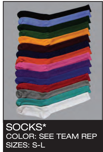
SOCKS* COLOR: SEE TEAM REP SIZES: S-L